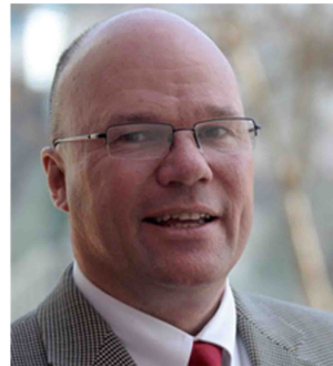
Sheldon Day 谢尔顿·戴伊 Mayor of Huntsville, AL