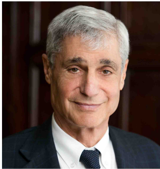
Robert E. Rubin 罗伯特·鲁宾 Chairman of the Council on Foreign Relations; Secretary of the Treasury, 1995-1999

Featuring a catered reception, panel discussion via webcast, and a local program with